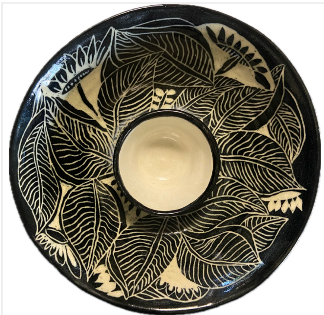
Artwork by Tanya Shorey

ABN 60 623 179 734 Postal Address PO Box 1470, Cairns QLD 4870 Clubhouse 28a Grove St Cairns 4870 Account 119552826 BSB: 633-000 Account Name: Cairns Potters Club Inc President Lone White / Phone contact 07 4053 7508 Email cairnspottersclub1@gmail.com Website www.cairnspottersclub.com