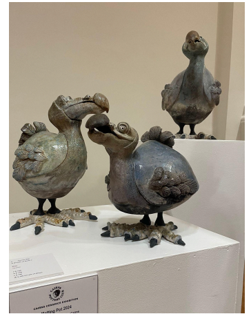
4. A Doodle of Dodo's