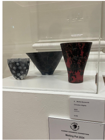
2. Cinnabar Nights