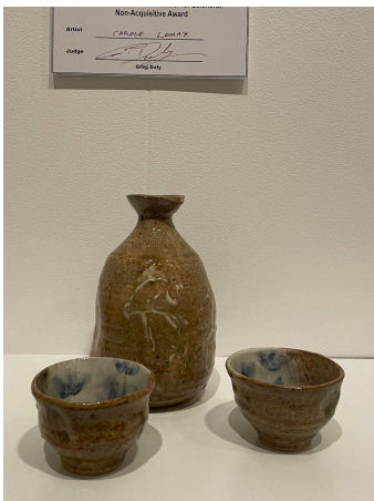
5. Sake set - Kiseto