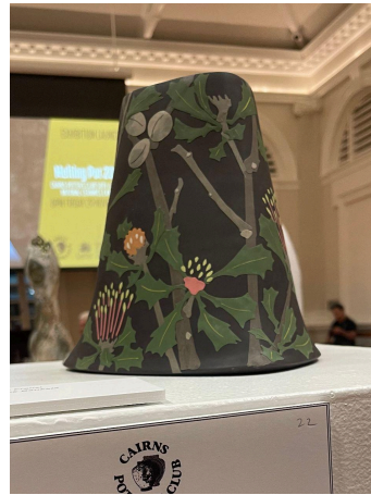
3. Matchstick Banksia